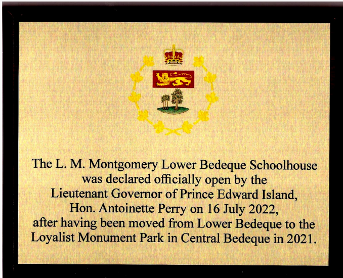
Two plaques were unveiled during the opening ceremony.