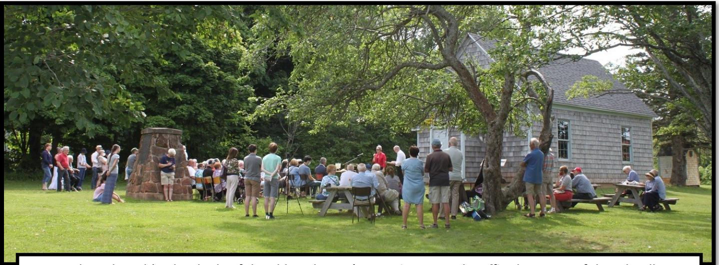
102 people gathered 'in the shade of the old apple tree' to participate in the official opening of the schoolhouse.